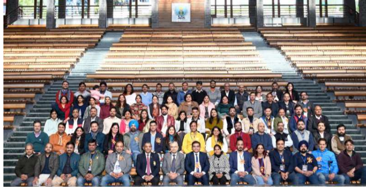
ALUMNI MEET 2023 09 DEC 2023 JAYPEE UNIVERSITY OF INFORMATION TECHNOLOGY WAKNAGHAT

The alumni also revisited their hostels and cherished locations on campus, evoking a sense of nostalgia. This reunion not only facilitated connections between past and present members of the JUIT family but also allowed alumni to witness the growth and evolution of their alma mater.